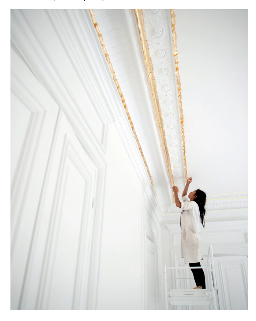
An example of gilding, the Atelier Attilalou (decorative painter).