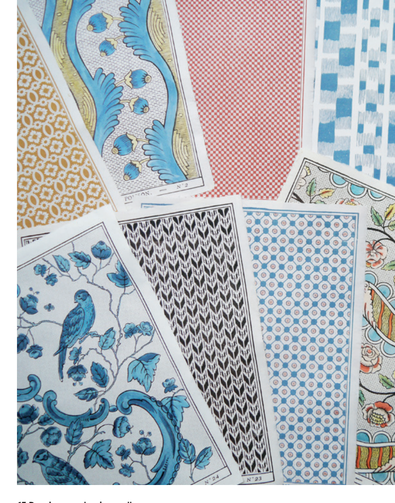
13 Dominos, or domino wallpapers, in the Atelier Antoinette Poisson (dominotier).