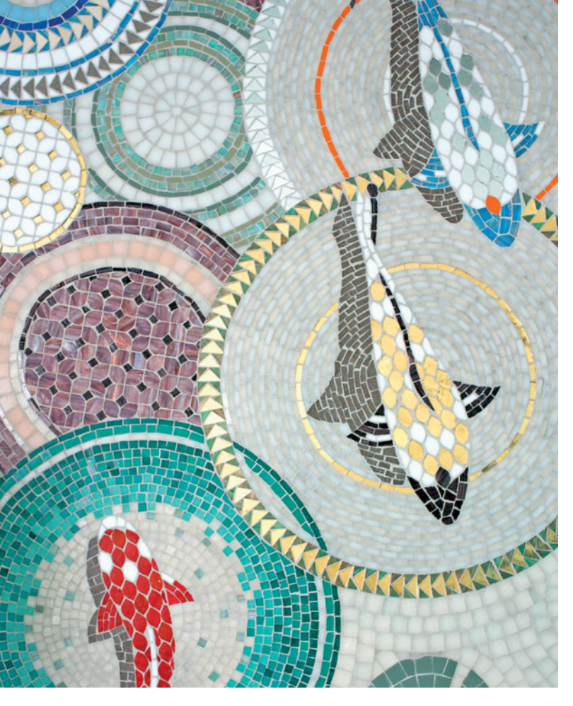
Carpes, detail of a mosaic, in the Atelier Lilikpo (mosaicist).