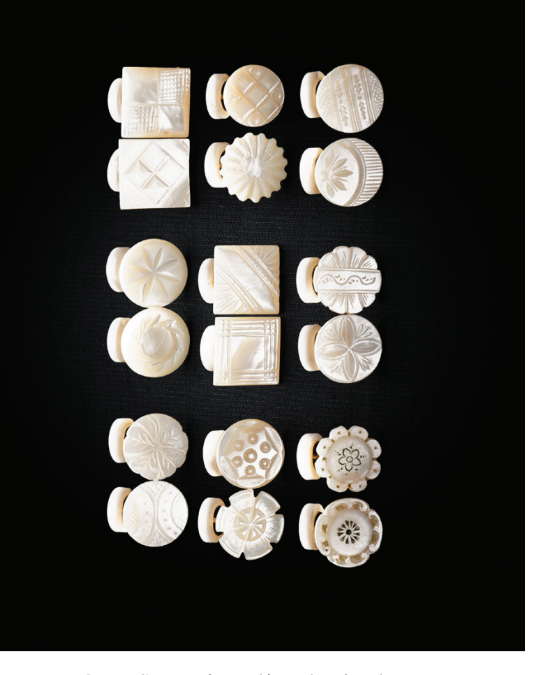
Paysage d'apparat, vintage white mother-of-pearl sleeve buttons with bronze shanks; buttons produced between 1920 and 1930 by Henri Hamm (artist), reinterpreted as cufflinks by Samuel Gassmann (designer).

Wall panel carved in pleats, gilt and blue linen, the Atelier Pietro Seminelli, Maître d'art (specialising in textile creation and the art of pleating).