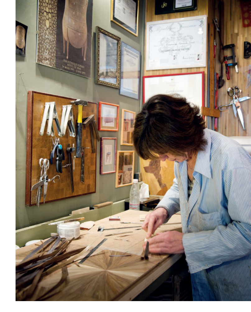
The Atelier Lison de Caunes (straw marquetarian).